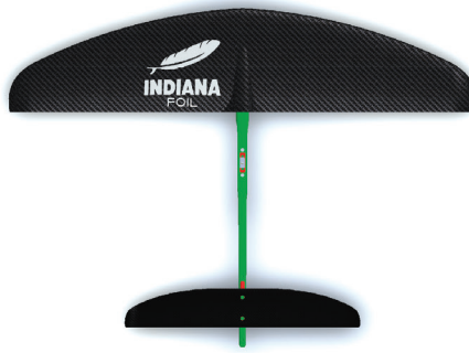
STANDARD Fuselage Length

A good balance between stability and performance