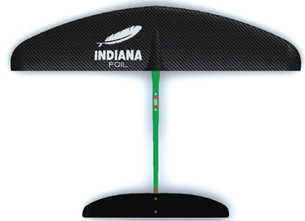
LONG Fuselage Length

Maximum pitch resistance Highest stability Maximum yaw resistance