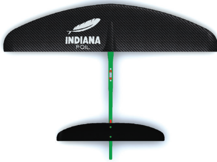
SHORT Fuselage Length

Maximum looseness Highest turning speed Best pump performance